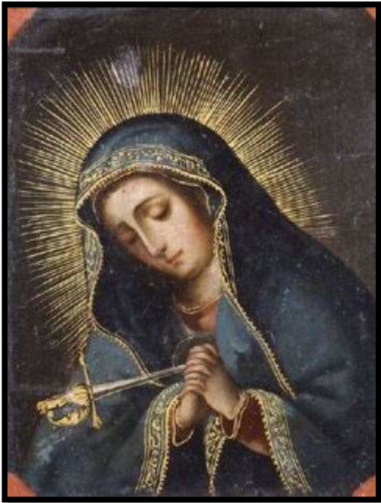
OUR LADY OF SORROWS

Fresh apples, plums, and pears for the picking. Please contact Peggy Demers at 541-954-7799 for more details.