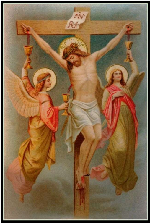
The Precious Blood of Our Lord and Savior

Eucharistic Crusade June’s Intention So that more souls may come to know and love the Sacred Heart of Jesus even better.